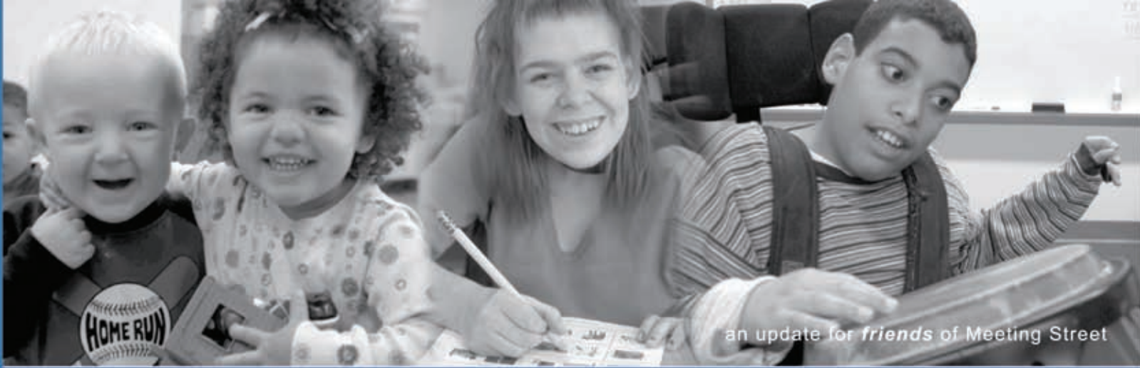
an update for friends of Meeting Street